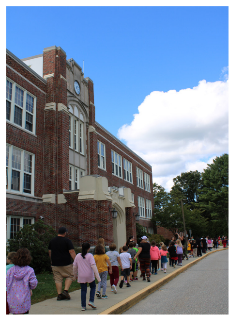
Preschool and Grade 3 took Community Walks on Wed. 9/28.

The fourth grade has completed benchmark testing and have started to settle into a routine to focus on both academics and SEL. In SEL, they are working on defining the difference between beliefs, values and opinions and exploring ways in which they can respect others' opinions. In ELA, students have been working on elements of plots, specifically looking for clues that can develop the exposition of a plot. In math, students are working to find factor pairs and using those pairs to determine whether a number is prime or composite. Students are also continuing to build their fact fluency with 2's, 3's and 5's. In SS, students are learning about New England and its landforms and landmarks that can be found in each northeastern state. In science, students are working on what happens to a rock when it detaches and falls down a mountain, and discussing root and ice wedging. They recently did a "sugar shaker experiment" to reinforce these skills.